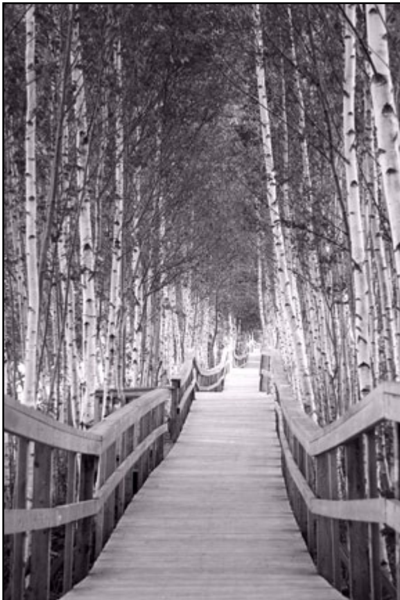
Waterfowl Park Mt Allison University