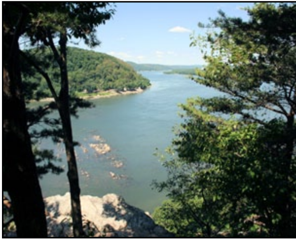
Susquehanna River, Susquehanna, Pennsylvania

Twenty-five years later, the Envirothon returns home to Pennsylvania, where it got its start. Originally called “Enviro-Olympics” in 1979, it began with only a few Pennsylvania counties competing against one another. It has since grown to include all 67 counties of Pennsylvania and also 46 states, eight Canadian provinces, and one Canadian territory. What started as an idea for a fun way to get students to learn about our natural resources has now become North America’s largest high school environmental education competition, now known as Canon Envirothon!